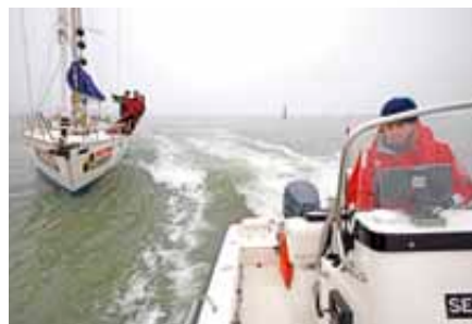
With throttle on and crew out, some wake might be all you need

If creating a wake doesn't work, attach a tow line to the bow – make sure it's your line to avoid any potential salvage issues – then