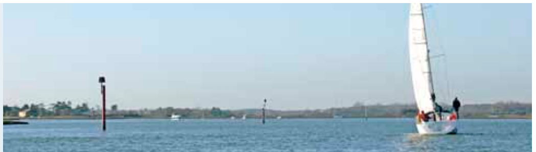
Favour the windward side of a channel, it's easier to get off if you ground and buys time if you have a problem