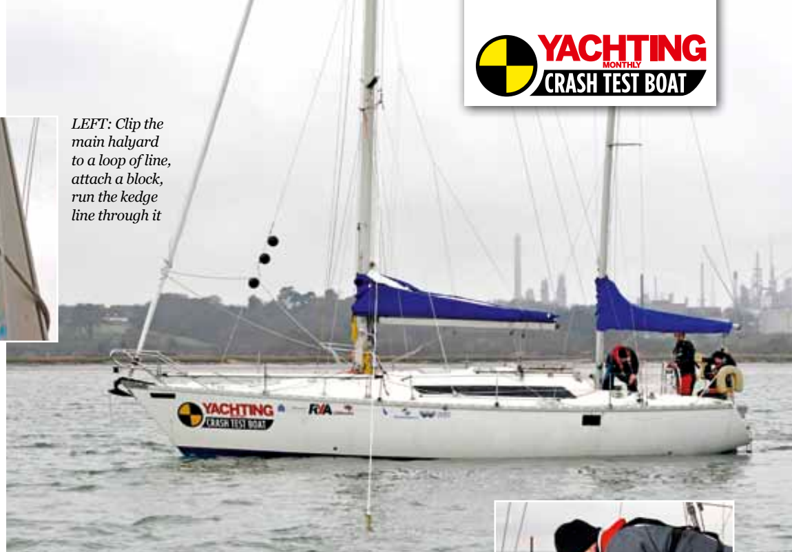
Winching the kedge line through a block up the mast was very effective

the most effective method of generating heel. If you don't have a spinnaker halyard, this method isn't suitable because the halyard is likely to jump out of its sheave. Instead, as we've done here, make a loop in a length of gash line, fasten a block to the loop and tie it around the mast. Then attach a main or genoa halyard, depending on whether the kedge lies fore or