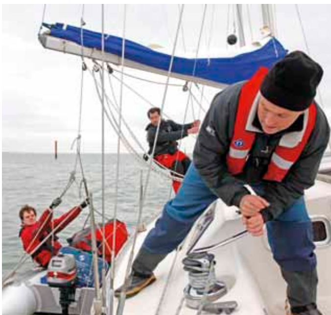
With a foreguy on the boom and crew weight outboard, we heeled well