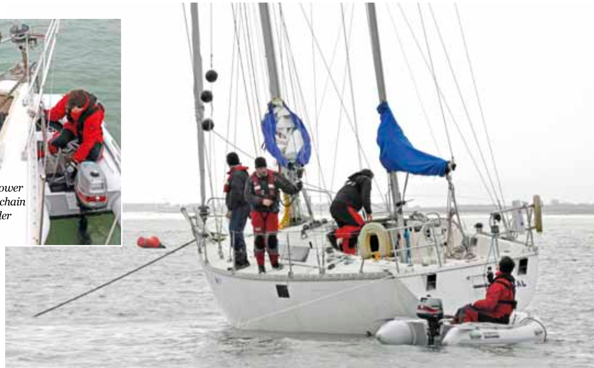
The bower anchor protects your position and the kedge could help you haul yourself back down your track