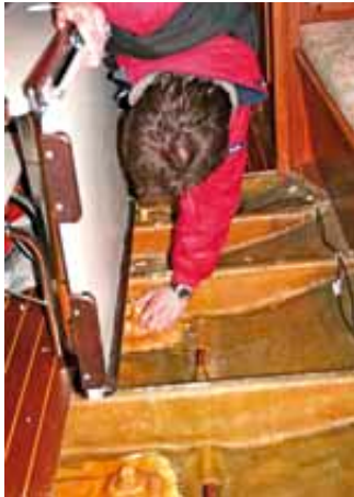
Check keelbolts and empty 'downhill' lockers to inspect hull

Next, secure all hatches and cockpit lockers, cover your coachroof ports with storm boards if you have them. Remember, that when heeled the exhaust and heads swan necks may no longer work and could possibly allow water to run back into the engine or hull. If you're drying