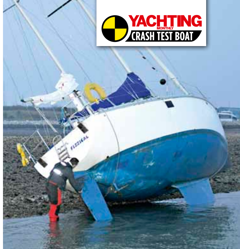
Rudder and keel may have sustained damage. Check them while you can

Now you can settle down below, shutting the washboards behind you, and prepare for a very uncomfortable few hours at an angle that makes everything difficult. It was both unnerving and exhausting moving around on deck and below at 45 degrees – the galley was unusable – so I found a berth and slept for an hour. In stronger conditions, or on a lee shore, grab the hand-held VHF radio, shut the washboards behind you, carry the tender ashore and wait for the tide to return. Notify the Coastguard that the crew is no longer on board. Perhaps you