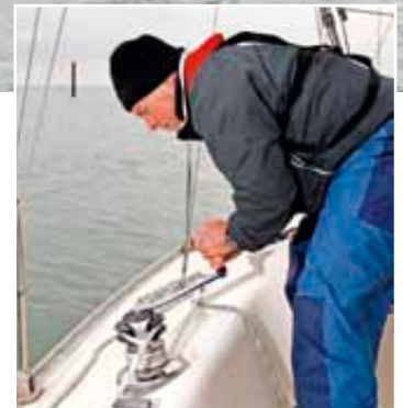
Mechanical advantage means this method involved little effort

aft of the shrouds, rig a downhaul on the loop, run the kedge cable through the block and, with plenty of slack in the cable, haul it up to the first spreaders. Run the cable down from the block, through a genoa car and onto a primary winch, then winch the kedge cable to induce more heel, simultaneously using the engine to drive her off.