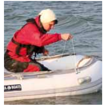
If bow leadlining doesn't reveal anything, launch the tender

Before setting any ground tackle, check for deeper water using a leadline – it needn't be more complicated than a shackle on a length of knotted string – poled out using a boathook either side of the bow, beam and stern. If you don't learn anything from that, launch the tender and leadline further afield to establish where the deeper water lies. While we were leadlining, the line would often be taken by the current so try moving with the current to get an accurate reading.