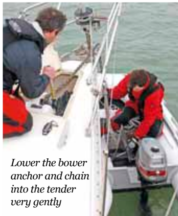
Lower the bower anchor and chain into the tender very gently

We shackled the anchor to the tender's cleat and towed it in the water because it made launching much easier than heaving it overboard. If you have an electric windlass, give the throttle some revs in neutral and haul the cable