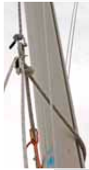
LEFT: Clip the main halyard to a loop of line, attach a block, run the kedge line through it

With the kedge well set in deeper water, we tried to increase heel by improving leverage using the mast height. If you have a spinnaker halyard with a swivelling block, tie a loop in its end, attach a block and run the kedge cable through it, down to a genoa car and back to a primary winch. With plenty of slack in the cable, haul the halyard up the mast and start grinding the winch. In our experience this was easily