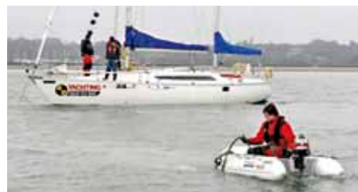
Pay out the kedge chain before setting in deep water