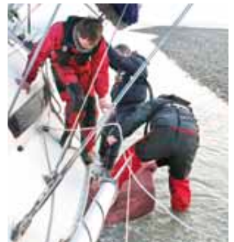
... we tried kicking cushions into the gap, and failed

offered the best protection, or the heads door stuffed into a sleeping bag. For a hypothetical grounding on rocks we considered shoving a partially deflated tender bow-first into the gap, hauling the painter under the hull, and re-inflating the tender. After our experience with the fenders, a more realistic choice seemed something board-backed which wasn't buoyant.