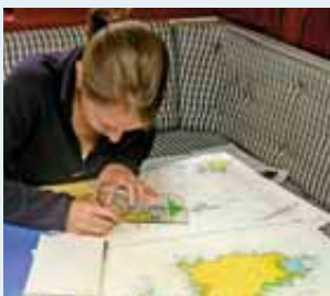
Avoid surprises. Know where you are and what to expect