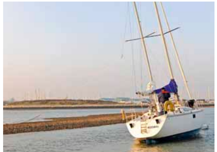
Once she's heeling the right way, prepare to get wet protecting the hull

bower anchor on the sand bar to guarantee we didn't topple downhill. Then we used the elevated kedge line, hauled through a block attached to the spinnaker halyard and back to a winch through the genoa car.