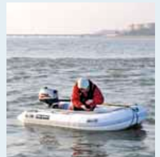
A leadline reveals your path off the putty. 'Read' water surface: shallowest patch behind dinghy

■ In shallow water, sail the boat upright unless she is a bilge keeler, in which case her draught may be greater when she's heeled over than on an even keel.