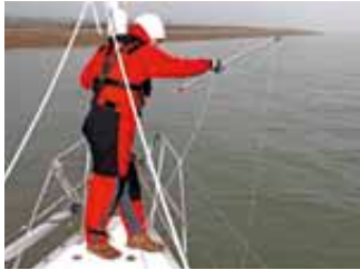
First, use a leadline at the bow to find out where deeper water lies

If you're still not free, drop all sail, lift the cabin sole, check for water ingress and make sure the keelbolts are secure. Next, shut the stable door by checking your position on a chart to find out what the bottom is and where deeper water lies. Also check the tide. If it's rising, just wait for 20 minutes or so. If it's falling, keep trying to haul yourself off. If you can't, you have up to six hours to learn your lesson. The worst case is running aground at HW Springs. You could be there for two weeks.