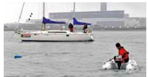
Fit a trip line and set the kedge down your track

tight to make sure the anchor's set and that the chain hasn't piled up on top of it. Without a windlass, hitch a line to the chain, or lead the cable aft, to a winch and get some tension in the cable.