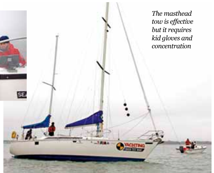
The masthead tow is effective but it requires kid gloves and concentration

you're clearly well on and will remain so until the tide refloats you. Next call the Coastguard on your VHF radio to notify them of your predicament. They will want to know whether you are safe, how many are on board and to establish a working channel. If you are on a rocky bottom, make sure they are aware that you will need to abandon if a rock pierces the hull. If you see any powered traffic, hail them on Ch16, or