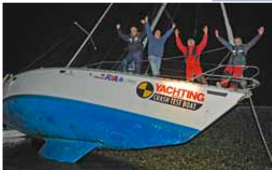
'Help!' We learned the RYA-endorsed hull-protection method doesn't work

The nature of the grounding will suggest what type of bottom you've found. Slow deceleration means mud, quicker deceleration means gravel, sharper still is sand and a dead stop is a rock or a wreck. Check charts to confirm but be aware that things can change – as a Yachtmaster Instructor, our consultant Simon Jinks once ran aground on a Ford Capri. If you're grounded on rocks, use only the heeling techniques – don't attempt to turn the yacht because you could rip out the keel.