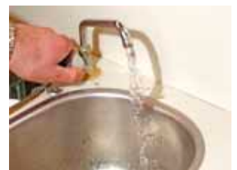
Emptying water tanks lowers displacement and reduces draught

Next we tried another method of reducing draught. We loaded the tender with anything heavy – liferaft, toolkit, outboard, jerry cans, mooring warps, spare sails, etc – emptied the water tanks then tried to motor off again while winding on the kedge line. Then we moved the loaded tender round to the offshore side, attached the main halyard to the boom end and rigged a foreguy as before, rigged a bridle for lifting the tender, and ran the lifting line through a block on the boom end, then a jib car and back to a primary winch. The lifting line chafed on the lifelines so a block