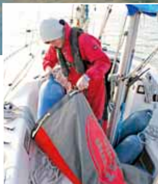
Fenders in a bag seemed like a quick, compact, sensible solution...