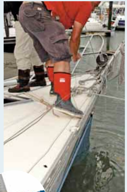
Once in place, the fothered sheet proved a perfect fix