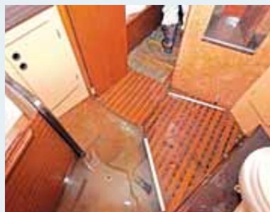
Panic tends to rise with the water level but it's important to think clearly

the first 7-8 minutes of the test, of which maybe 30 seconds was spent with nothing over the hole, displacement increased by 2,000kg, suggesting 2,000 litres (440 gallons) had leaked in, and the water was 5cm (2in) above the sole and 20cm (8in) above the bilge. When holed, response speed is of the essence.