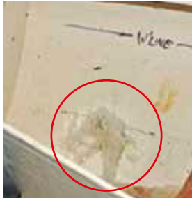
It might not look too bad but we took on 2,000 litres of water in just 7-8 minutes

As the boat was lowered and the water began to gush in, my first reaction was a sudden rush of adrenalin. I grabbed a bright orange cushion, which has always lived in the forepeak of the Crash Test Boat, and held it over the hole with my boot. This took a second and greatly reduced the flow of water. It was a major confidence boost and definitely the quickest quick fix.