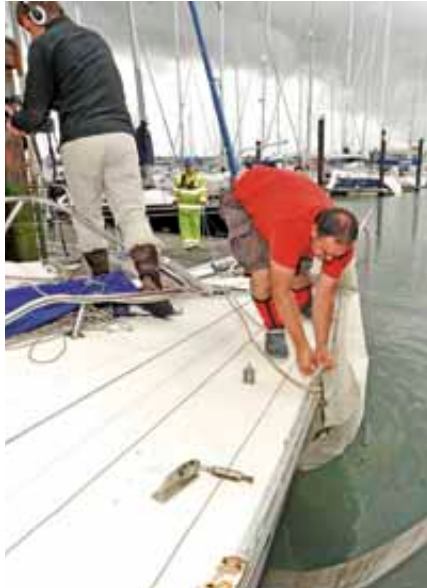
Fothering a sail took a long time and any sail is fundamentally ill-suited for the job

Tried and trusted by Admiral Nelson after cannon ball damage, this involved wrapping a sail around the hull, leech forward as it's smoother. It was not quick. Lines needed attaching to each corner, then it needed a boathook to sink the sail under the hull's knuckle. Twists needed to be removed before see-sawing the sail into place and securing very tightly to the toerail. Sadly, due to the sail's built-in camber, it 'pulsed' against the hull, proving a decent fix one second, awful the next.