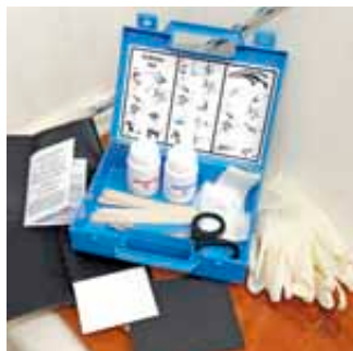
With a good fother in place, the Kollision Kit made a sound repair

Our plan was to only use kit that you might find on the average cruising yacht. By and large, we managed to stick to that. One exception was the hand drill. We were lifting and draining the boat before the internal water level rose above the hole so that we could see the water gushing in and assess the effectiveness of each