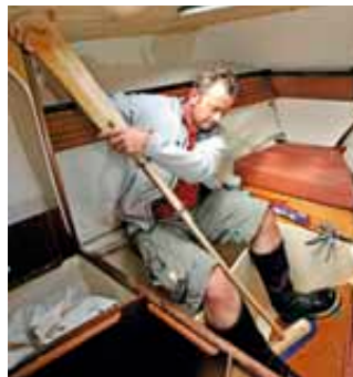
Two items hose-clipped together make an adjustable brace

It was difficult to shape the cushion to the hole. A thinner pillow worked better, but we didn't have a bracing board small enough for the tiny orange pillow. Nor could we find a brace strong enough to exert sufficient pressure. The deck broom was about to break so we used the boathook, which did break. We could have sawn the spinnaker pole, but to what exact length? Could we deploy it in such a confined space? Given plenty of time, it would have worked but we timed it out to try other methods.