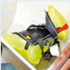
It reduced flow significantly but opened up splits around the hole

This idea really appealed to me – fast and ingenious. At least, it might have been, with a bigger, rounder hole. As it was, I needed to stuff the assembly through the hole with an oar, making the hole bigger and the gush of water worse. Once in place, I fired the manual inflator and the flood slowed considerably. However, the inflation did open splits in the hull and water seeped relentlessly through them.