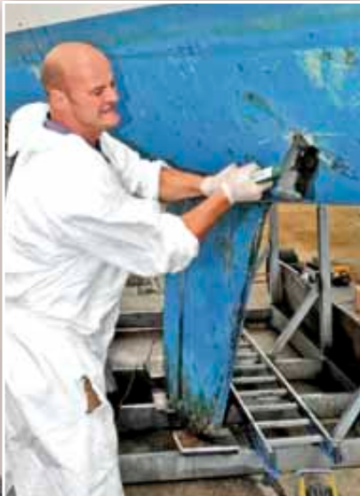
Using a hammer, chisel and angle grinder, it took Osmotech's man 25 minutes to breach the Crash Boat's hull