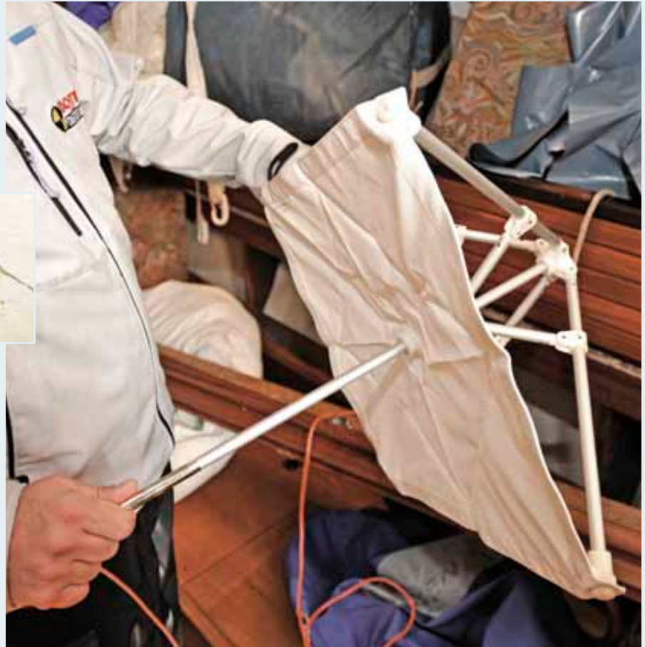
The Subrella is no longer made. Production volumes were not high enough to bring down costs