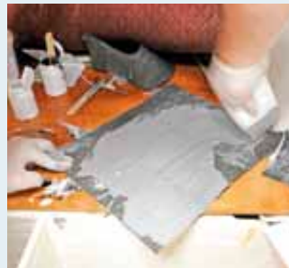
Smear the mixed epoxy on the furry side of the polymat supplied