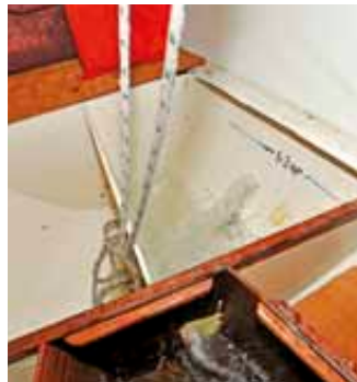
The sail 'pulsed' against the hull, making a bad repair one minute...