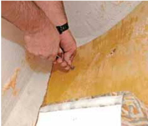
ABOVE: Drilling holes in the hull wasn't easy with a hand drill but we eventually managed it. LEFT: Self-tappers held the board well but water was beginning to 'sweat' through it