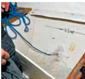
LEFT: We could have stamped a cushion over the hole while running the hauling line

A piece of engine room hatch, lined with sound-proofing sponge, was pre-drilled as the Mark II version of the flat plywood board solution. Once again, a loop of line was pushed through the hole, which Kieran, on deck, snagged with a boathook and inserted through the board's pre-drilled hole. It took the same time to deploy, but was much more effective.