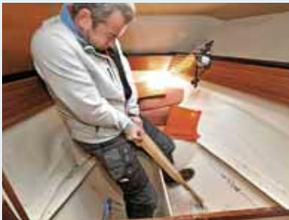
The Subrella was too big for our hole and needed forcing through with an oar