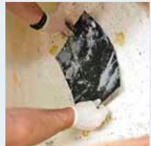
Then, with the fother in place, place the mat over the hole