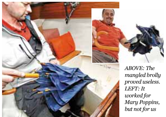
ABOVE: The mangled broolly proved useless.