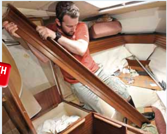
Brace the repair against the hull for five minutes while the epoxy cures

Is it possible to save your boat if she's holed? Find out on the next page ➔