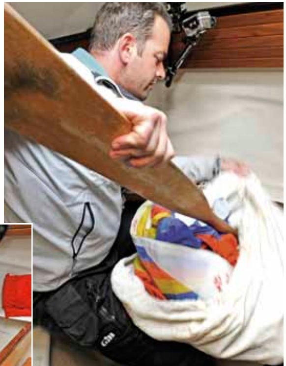
ABOVE: Another simple idea, but did it work?