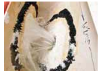
Bad bracing and poor curing conditions scuppered this idea

We slapped half a tub of Ramonol marine grease around the hole and squeezed a ring of fast-curing mastic onto one side of a 2mm marine plywood board. The plan was to brace this board over the hole using a cushion and bracing board, with the grease making a quick seal while the mastic cured to provide a more lasting seal. Unfortunately, due to the bracing problems described, we never exerted the pressure required, the leak never stopped and the mastic never cured. Solve the bracing issue and this might work.