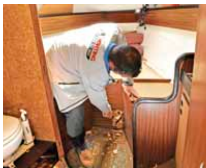
Clearing plywood joinery is easy, but glassed-in ply bulkheads are much tougher

Visit our website www.yachtingmonthly.com/sinking to see Yachting TV's video footage of this test