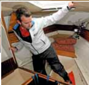
ABOVE: It's about as low-tech as a repair can get. LEFT: It's fast and effective but what's your next move?