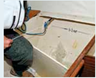
We poked out our hauling line using a straightened coat hanger

This involved using a coat hanger to push a loop of line out through the hole, which a crewman on deck snagged with his boathook. He then inserted the line through a pre-drilled bunkboard, knotting the end to hold it in place, before I hauled the board from inside the boat, tight against the outside of the hull. A G-clamp proved invaluable, providing a convenient anchor to tension the lines in this and other methods of stemming the flood. It took a couple of minutes to implement and the results weren't spectacular.