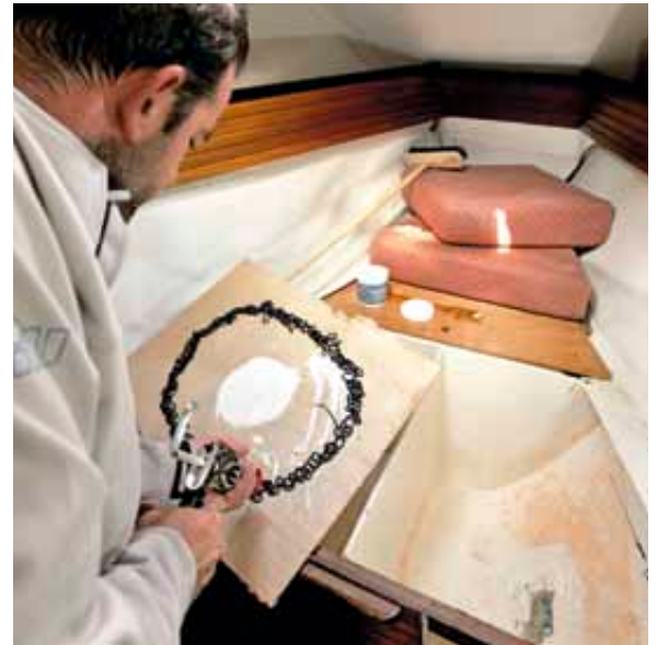
We put grease round the hole and a ring of mastic on the board