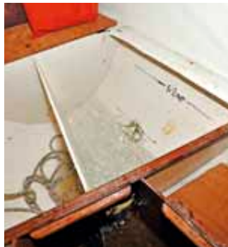
... and a pretty decent one the next. The result isn't worth the time