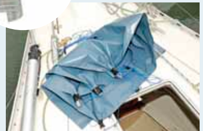
Strong Grips were taped to each corner