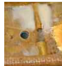
Two drainage holes were drilled either side of the keel

First, we explored emergency measures to stop the flood, buy time and regain control. For these, we used kit you would expect to find on an average cruising yacht. Then we tried out some ideas for making good a longer-lasting repair that would have enabled us to sail home – hopefully without continual pumping and bailing.