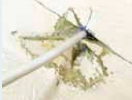
The Subrella slowed the flood of water

This is a purpose-made emergency collision 'patch' – a sort of hi-tech 'umbrella'. As before, a line was tied on to prevent loss before it was thrust through the hole. Because of the size of the Subrella and the relatively small hole, it had to be hammered through with the blunt end of an oar. The hole was enlarged as a result but, once deployed with its safety line secured to the G-clamp, it slowed the flood to a level that would definitely buy you time. Alas, it is no longer in production and the patent belongs to a now defunct company.