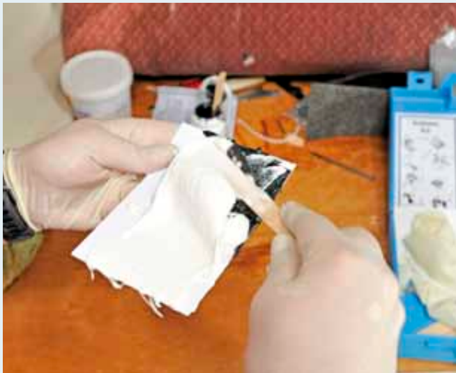
Scoop out and mix the two parts of epoxy using the wooden paddle