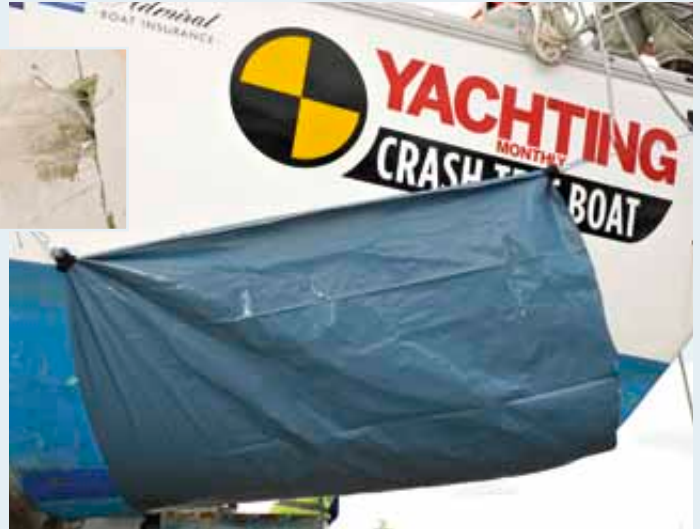
ABOVE: Get the mat right and you can stop water coming in completely. INSET: Our second mat didn't work as well and leaked when we moved