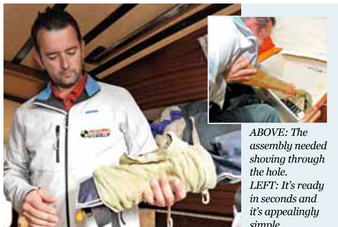
ABOVE: The assembly needed shoving through the hole.