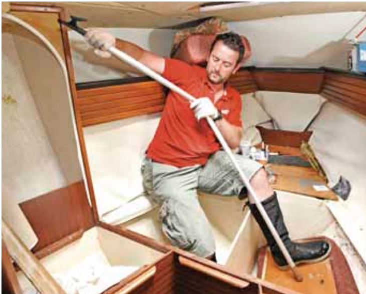
Bracing seems an obvious solution but in practice we struggled to make it work