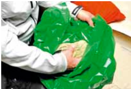
The idea is sound enough, quickly and easily prepared, but how does it work in practice?